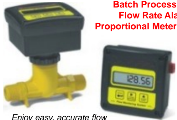
Enjoy easy, accurate flow measurement and control with the FD201 flowmeter.

Flow Rate and Totalizing Analog Output Batch Processing Flow Rate Alarm Proportional Metering