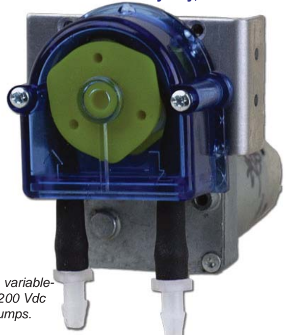
Compact, variable-flow SP200 Vdc HD pumps.

Variable-flow Reversible Heavy-duty, Vdc motors